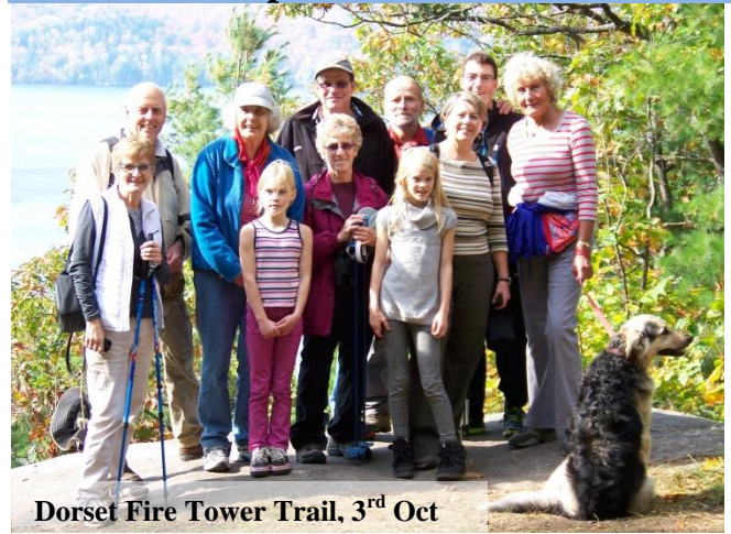
Dorset Fire Tower Trail, 3 rd Oct